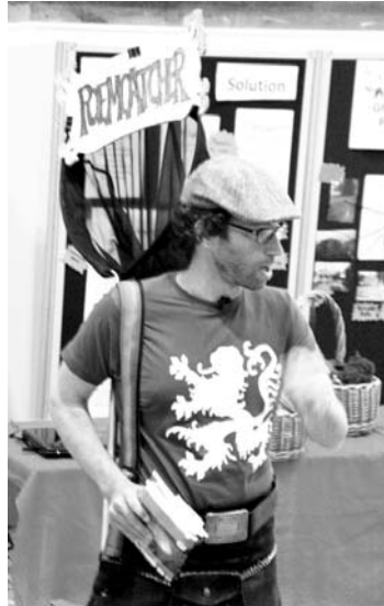
The PoemCatcher at work