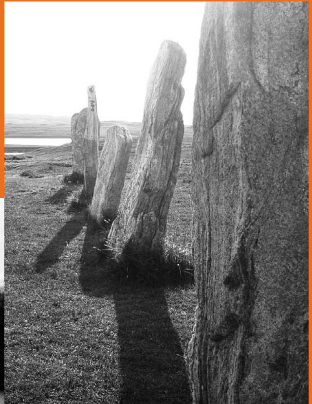
The Standing Stones at Callanish - Isle of Lewis