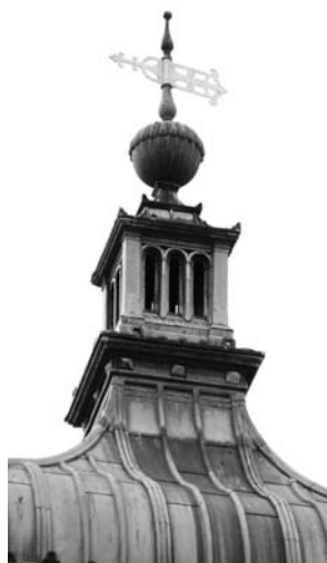
Which direction should we be going?