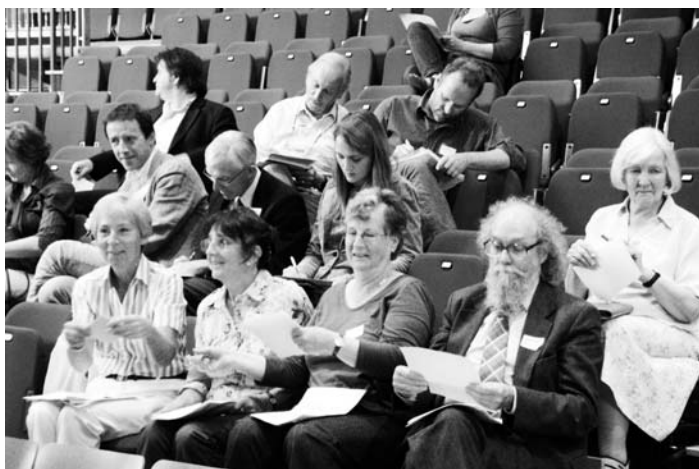
Poets in the making? Delegates at the Food for Thought Conference responding to the PoemCatcher's request for a poem in 60 seconds ...

'Nothing great was ever achieved without enthusiasm' . Ralph Waldo Emerson.