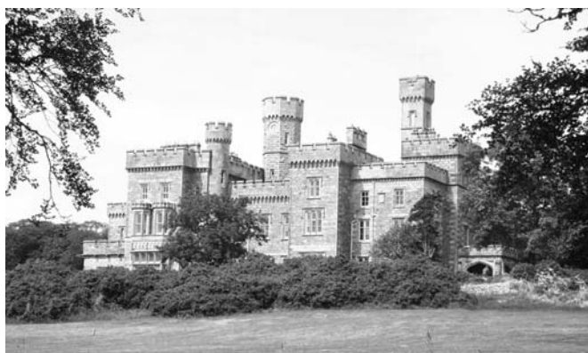
Lews Castle, Stornoway

As you may have noticed over the last few editions of the Newsletter we have been including pictures that take a sideways look at elements of the Scottish Heritage - whether that is the built environment or the landscape. We're trying to cover a wide variety of aspects of Scotland including the wilderness as well as the quirky.