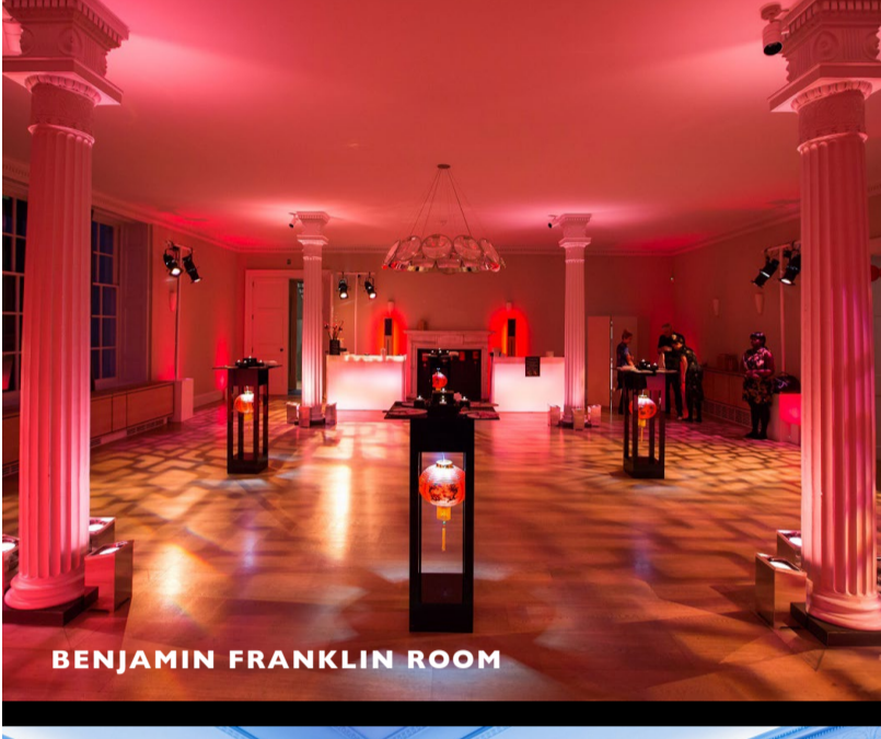
BENJAMIN FRANKLIN ROOM

Packages vary depending on your requirements, reduced drinks packages are available without the DJ/ dancefloor. Minimum numbers apply for different dates in November and December and all dates are available on a first come, first served basis. Package prices are quoted on a sliding scale, depending on your minimum number of guests.