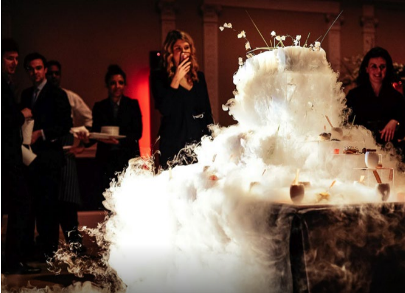
RSA 'PUDDING AT THE THEATRE'