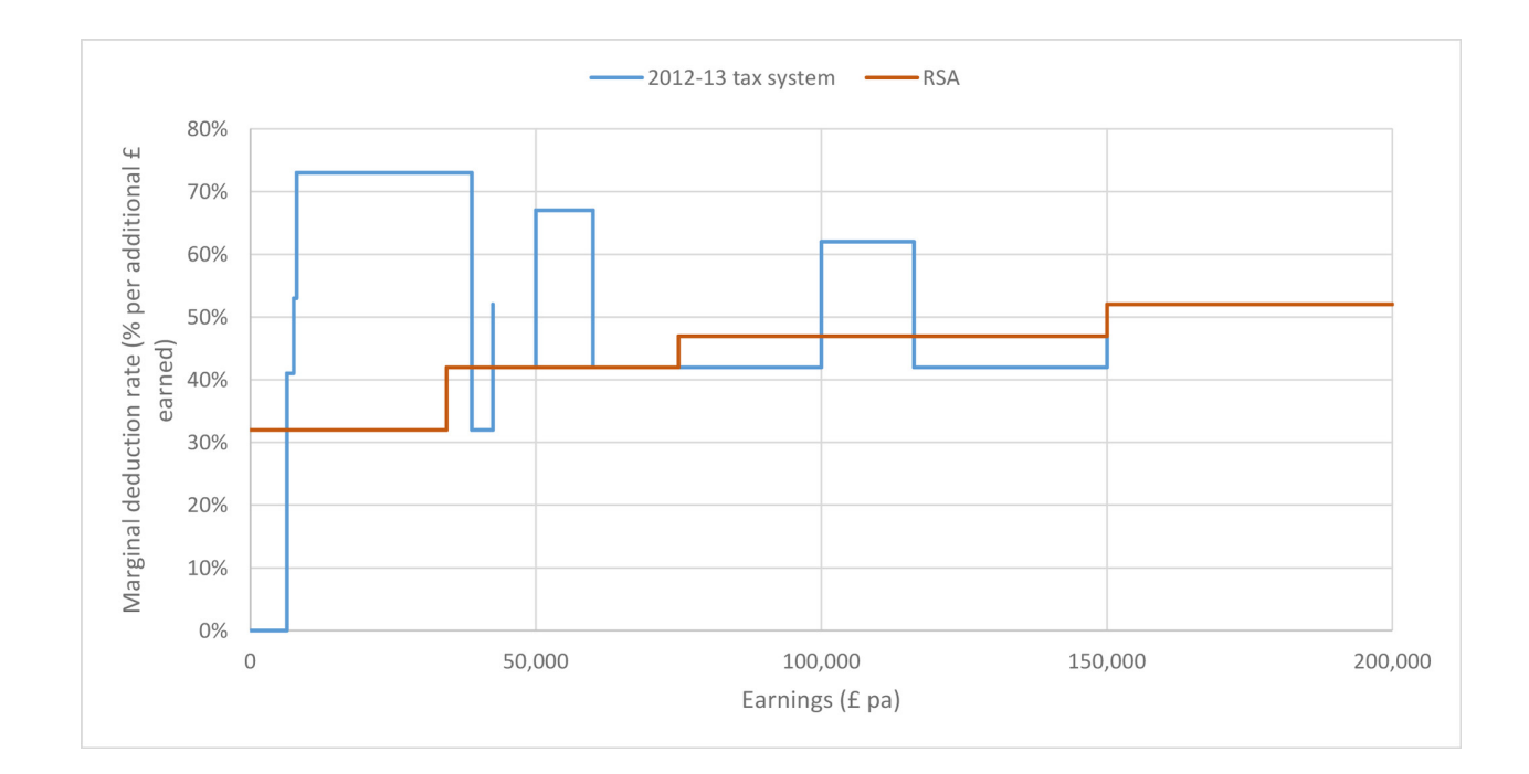
Figure 2: Marginal deduction rates under the 2012-13 Tax Credit system versus the RSA Basic Income scheme

The changes to the tax system that we have modelled above with the additional support for young children we propose would have a net cost in the range of £6.3bn to £10bn. When added to the estimated initial shortfall of £6.5bn under the Citizen's Income Trust proposal, this would mean a total additional cost of between £12.8bn and £16.5bn. This would be counter-balanced by additional income for maintaining a 50 percent additional rate above £150,000 which would raise between £100m and £3bn (depending on difficult to quantify behavioural impacts). This means a best case shortfall of £9.8bn and a worse case of £16.4bn. This sounds like a significant extra cost but it is in the range of the discretionary tax decisions taken in the last five years - and, indeed, over the course of the last generation.