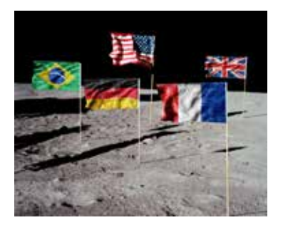
46 Racing for space Peter Marber anticipates the next Space Revolution