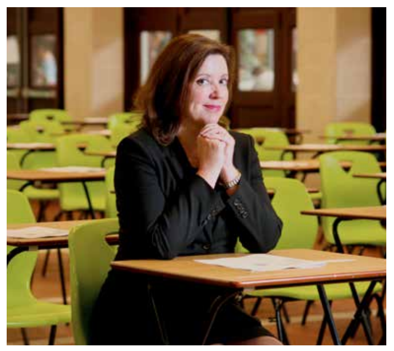
"There's no lack of ambition in England's children"

talk about extending school days, summer activities, all the programmes to get teenagers back together. In short, I don't think children have been scarred for life but we do need to take the problem seriously.