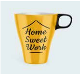
45 A healthy hybrid A flexible working model is the way forward, writes Alan Lockey