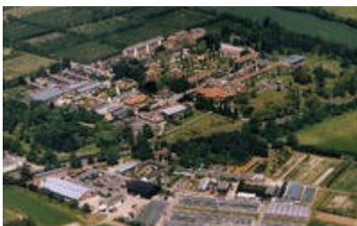
An Ariel View Writtle College Campus